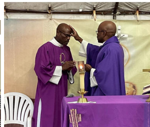
People receive ashes during Masses on Ash Wednesday, on Feb. 22, 2023. Ash Wednesday begins the Lenten Season.