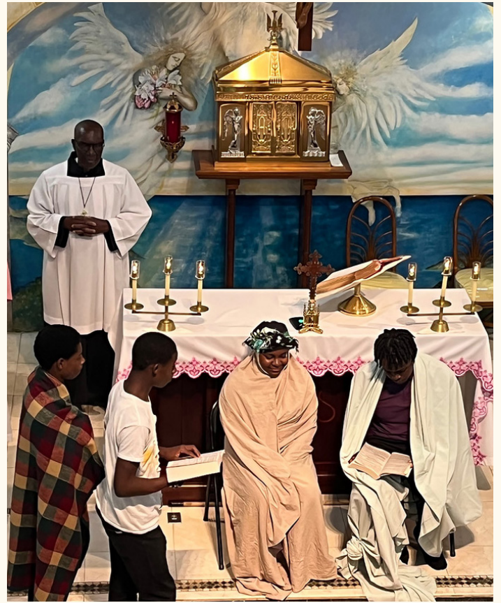
^The OLMC Youth Group dramatized the gospel reading on March 19, 2023.